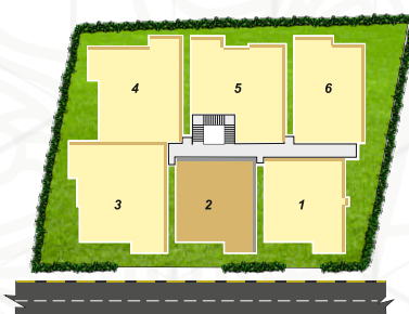
102, 202, 302 SBA - 1189 SFT NORTH FACING - 2 BHK