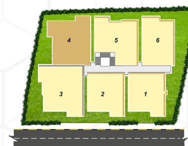
104, 204 & 304 SBA - 1453 SFT NORTH FACING - 3 BHK