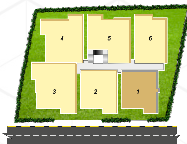
101, 201 & 301 SBA - 1208 SFT NORTH FACING - 2 BHK