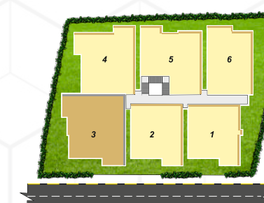
103, 203 & 303 SBA - 1566 SFT NORTH FACING - 3 BHK